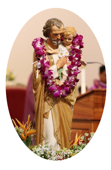
Please remember St. Joseph Parish in your will!

Served by the Blessed Sacrament Congregation